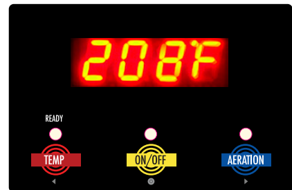
Large LED Display - 140°F - 210°F