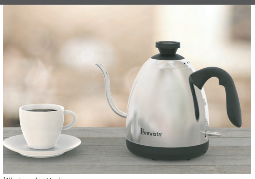
<sup>†</sup>All prices subject to change.