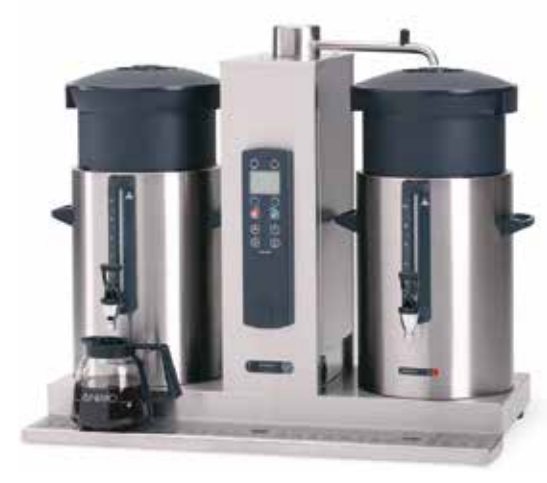
+ ComBi-line with two 10 litre containers: CB 2x10

ComBi-line machines offer the possibility of making large quantities of coffee and tea in a short time. A ComBi-line set-up is a combination of one or two continuous flow water heaters and one or two containers. The containers can be placed on a buffet, counter or serving trolley. The largest machine has a capacity of up to 1280 cups (160 litres) per hour.