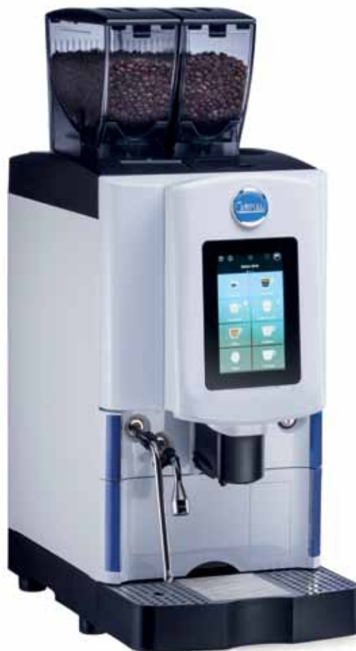
Optima Soft Plus