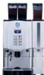
1 or 2 grinders Choco