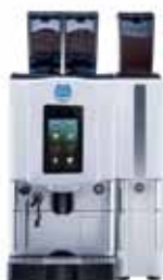
1 or 2 grinders Choco